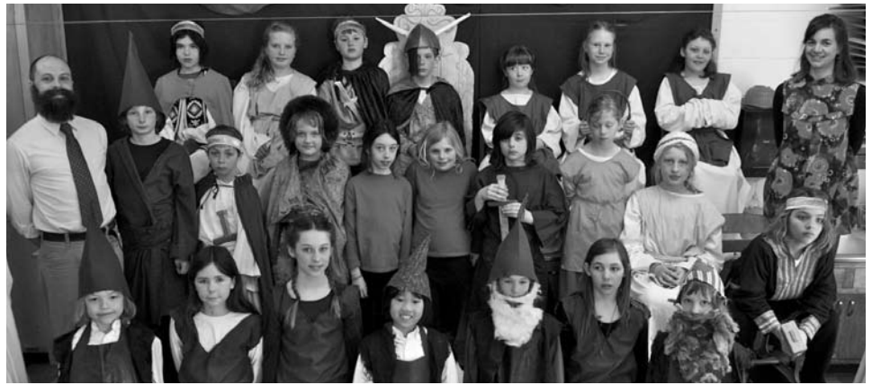
Grade Three & Four: Sif's Golden Hair