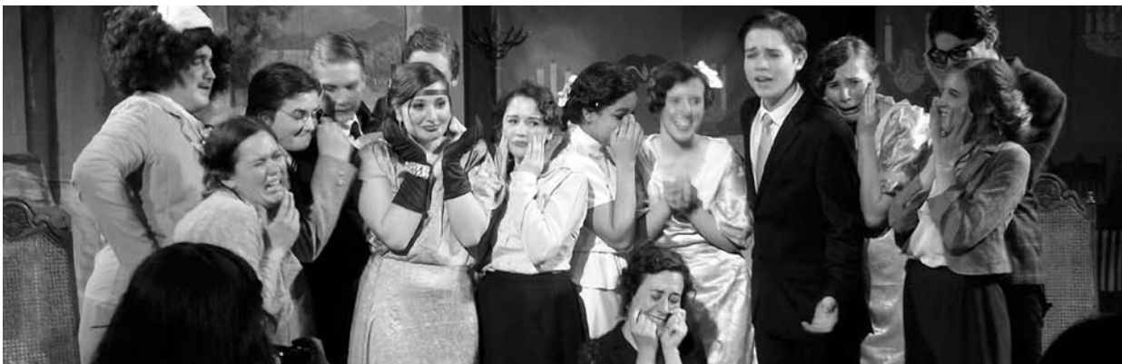
Grade Eight: Pride and Prejudice