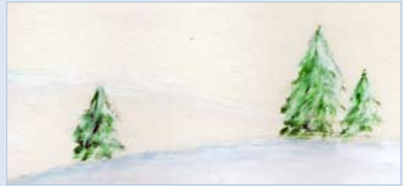
License #R0009463A - 10911

Need not be present to win. Winnings are subject to state/federal tax.